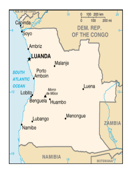
Fig.1 Maps of Angola and Mozambique

Data for this thesis were collected from the national capitals of Angola and Mozambique, whose locations are depicted in the maps below.